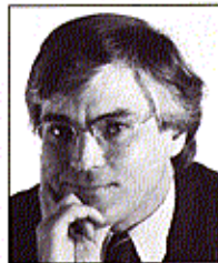
BY THOMAS FORBES

And the compositors who were steadily employed at the Tribune were probably just as sentimental about their days as tramp printers. There was a time, Inland Printer magazine wrote, "when a printer was not a printer until he had circumnavigated the globe, or at least traveled over the English-speaking part of it." Wherever the tramps traveled, swearing, fighting, and abusive language were violations of chapel rules. If you didn't believe what a man said, you'd civilly bang the lower end of your composing stick against the edge of the lower typecase. Violations of chapel rules were met with solaces —a fine or a lashing—but the threat of solaces for gambling and drinking didn't actually stop printers from jeffing for beer at elevens (meaning they played craps with 14-pt. em quadrants to determine who'd pay for the traditional 11 a.m. tool). And though I've never actually heard em quads bouncing onto a stone, or the sound of a wood stick hitting a typecase, that music is no less real to me than the squeak of a chase being locked.